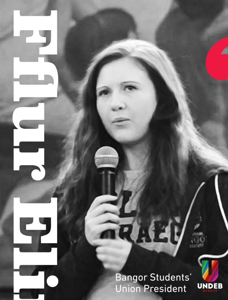
Bangor Students' Union President